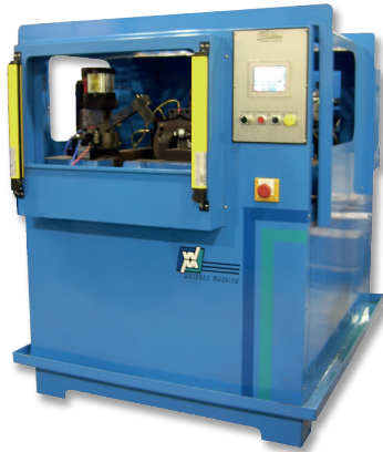
Shown with light curtains option