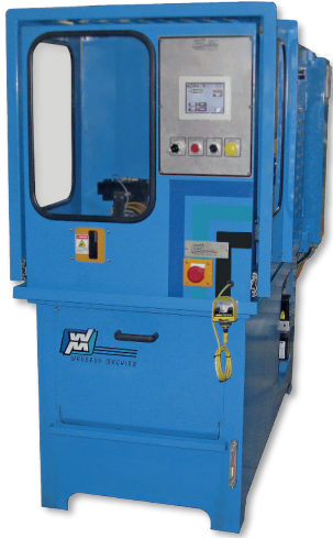
Shown with opti-touch cycle start option