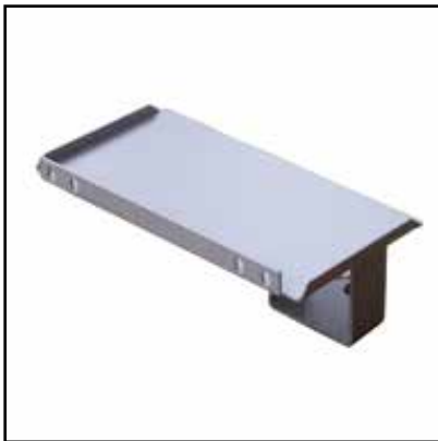
Connection machine-unloading roller table (Optional)

Connection between machine and loading roller table.