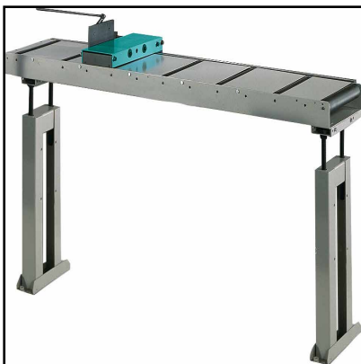
Unloading roller table with metric rod (Optional)

1° unit of roller conveyer (unloading side) with metric rod and lenght stop.Length: 2m, loading capacity 700kg.