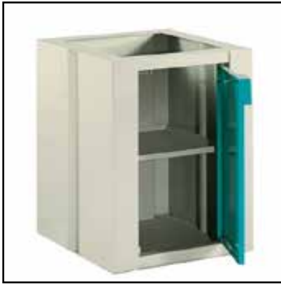
IBL floor stand (Optional)