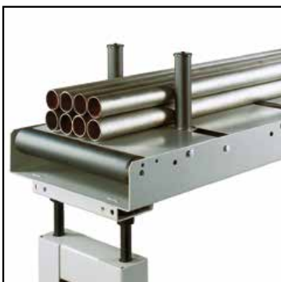
Vertical rollers (Optional)

Following unit of roller conveyer (unloading side) with metric rod and lenght stop.Length: 2m, loading capacity 600kg.