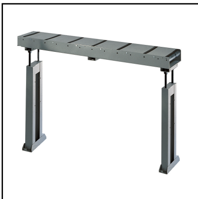
Loading/Unloading roller table (Optional)

Connection between machine and unloading roller table.