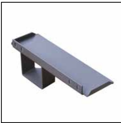
Connection machine-loading roller table (Optional)